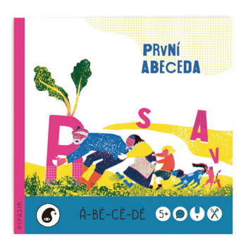
Paperback 21x21 cm, 48 pages