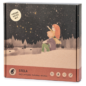
Packed in a box 26x25x3,5