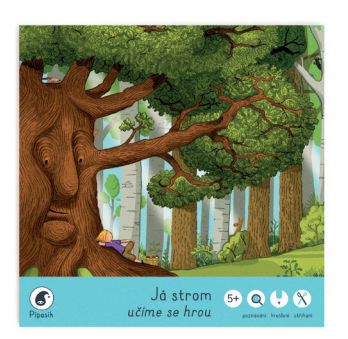
Paperback 21x21, 48 pages