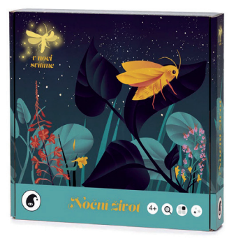
Packed in a box 22,5x21x3,5