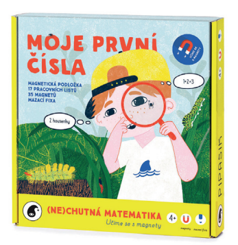
Packed in a box 23x24x3,5